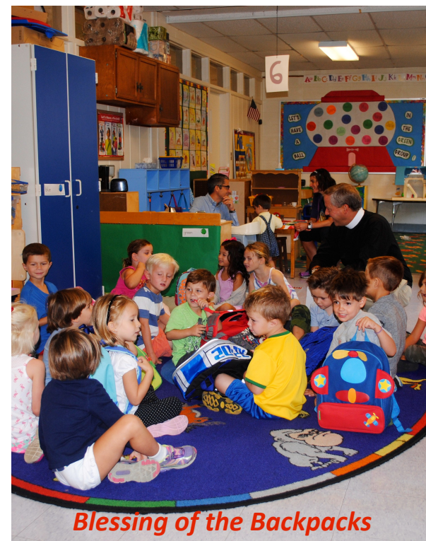
Blessing of the Backpacks